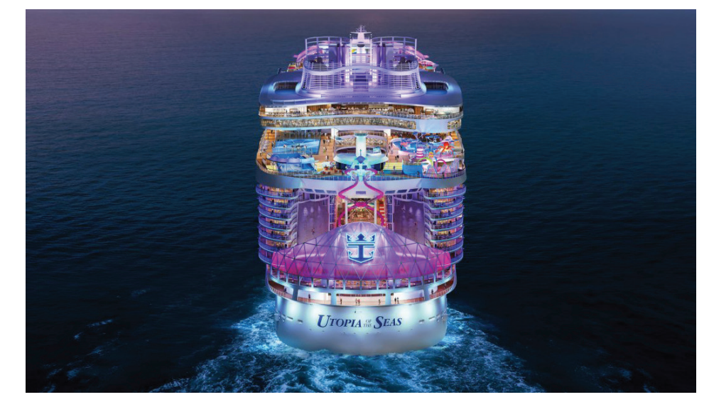
Utopia of the Seas | Submitted photo

*Prices are per person, cruise only, based on double occupancy [in interior stateroom] and in U.S. dollars. All itineraries are subject to change without notice. Prices are ictions apply. These may not be available during your voyage, may vary by ship and destination, and may subject to availab ility and change without notice. Certain res be subject to change without notice. Utopia of the Seas<sup>34</sup> reflects current design concepts and may include artistic rend rings and/or images of other class ships. Roval nal reserves the right to correct any errors, inaccuracies or omissions and to change or update fares, fees and sur ©2023 Royal Caribbean Cruises Ltd. Ships' registry: The Bahamas, 23012197 • 11/30/23.