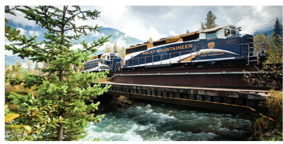
▲ The Rocky Mountaineer

visit the working shops, businesses, and homes. Board your motor coach for the Fairmont Palliser Hotel located in downtown Calgary.