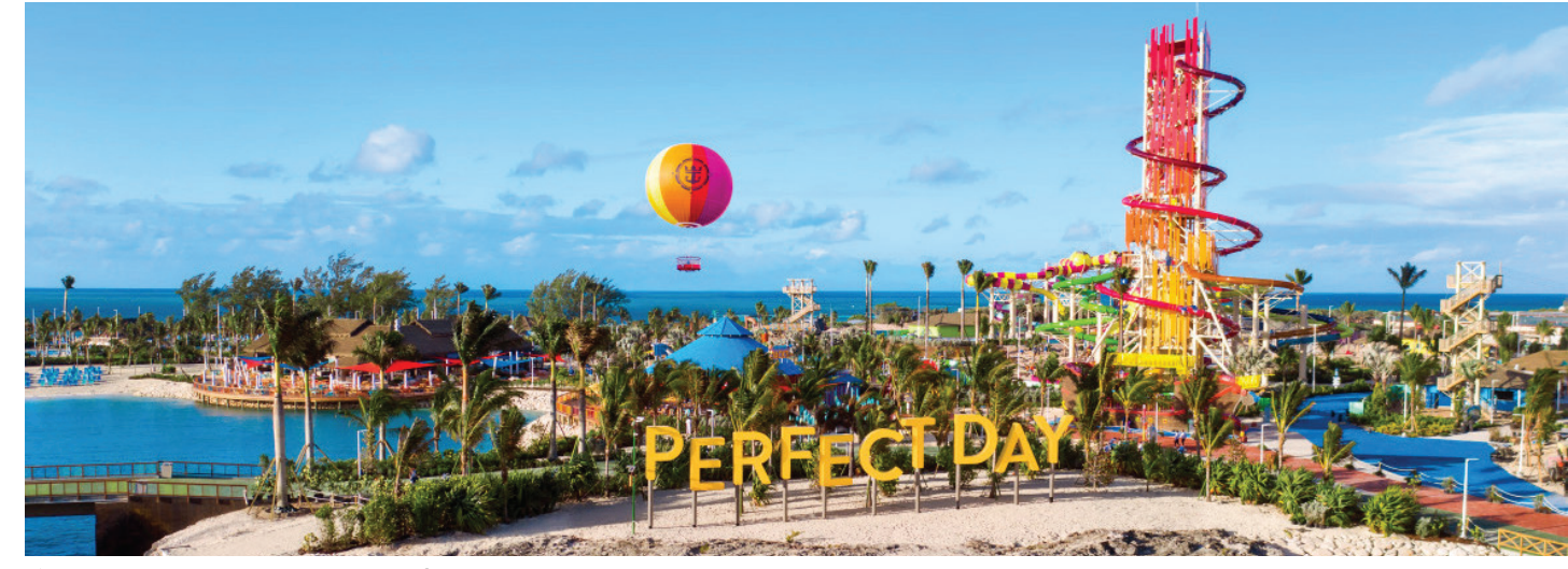
Perfect Day at CocoCay aerial shot. | Submitted photo.

Not only does the new program double the brand's number of year-round Caribbean sailings and introduces the first weekend itineraries, but both ships will now offer guests with the exciting opportunity to experience Perfect Day at CocoCay for the first time in